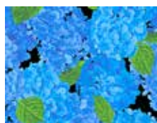
7728-B 3/8 yd