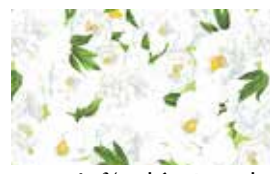
7729-L 3/8 yd (extra yds needed for backing)