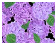
7728-P 3/8 yd