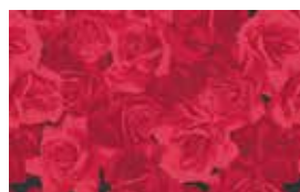
7726-R 3/8 yd