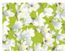
7730-G 1 1/2 yds